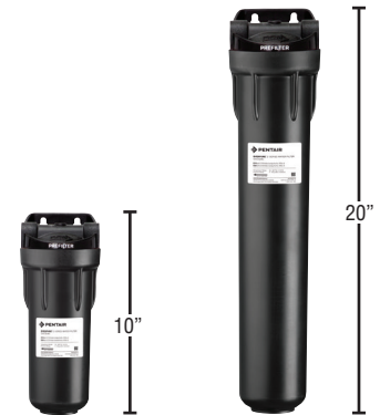
E-10 PREFILTER (9795-80)